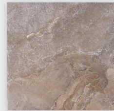
CANYON MARRÓN (PRCO) 33,3x33,3 cm / 13.1"x13.1" [P] M312