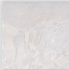
CANYON WHITE (PRCO) 33,3x33,3 cm / 13.1"x13.1" [P] M312