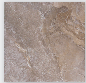
CANYON MARRÓN (PRCO) 45x45 cm / 17.7"x17.7" [P] M349