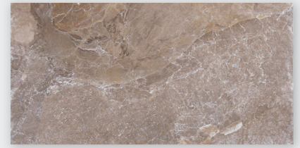
CANYON MARRÓN (PRCO) 30x60 cm / 11.8"x23.6" [P] M428