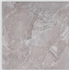
CANYON GREY (PRCO) 33,3x33,3 cm / 13.1"x13.1" [P] M312