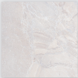
CANYON WHITE (PRCO) 45x45 cm / 17.7"x17.7" [P] M349