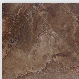
CANYON NOCE (PRCO) 45x45 cm / 17.7"x17.7" [P] M349