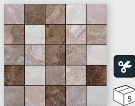
CANYON MULTICOLOR (MLLA) 4.8x4.8 / 30x30 cm / 11.8"x11.8" [P] P197