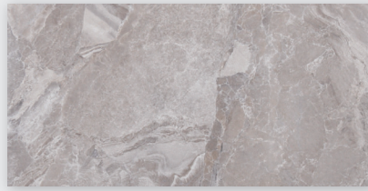
CANYON GREY (PRCO) 30x60 cm / 11.8"x23.6" [P] M428