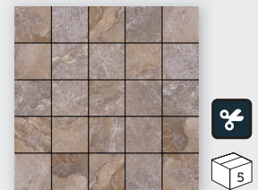
CANYON MARRÓN (MLLA) 4.8x4.8 / 30x30 cm / 11.8"x11.8" [P] P197