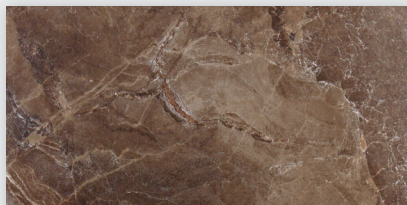
CANYON NOCE (PRCO) 30x60 cm / 11.8"x23.6" [P] M428