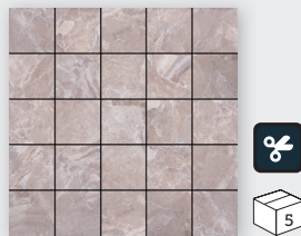
CANYON GREY (MLLA) 4.8x4.8 / 30x30 cm / 11.8"x11.8" [P] P197