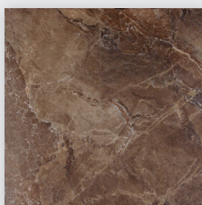
CANYON NOCE (PRCO) 33,3x33,3 cm / 13.1"x13.1" [P] M312