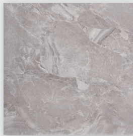
CANYON GREY (PRCO) 45x45 cm / 17.7"x17.7" [P] M349