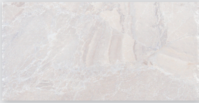
CANYON WHITE (PRCO) 30x60 cm / 11.8"x23.6" [P] M428