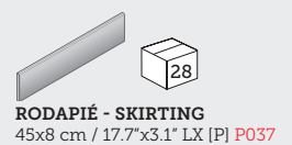
RODAPIÉ - SKIRTING 45x8 cm / 17.7"x3.1" LX [P] P037

* Este packing podría sufrir algún tipo de variación en producciones puntuales. / Exceptionally packing may vary. Diese Verpackungsdaten können bei bestimmten Produktionen variieren. / Liste emballage orientatif, exceptionnellement peut subir des modifications.