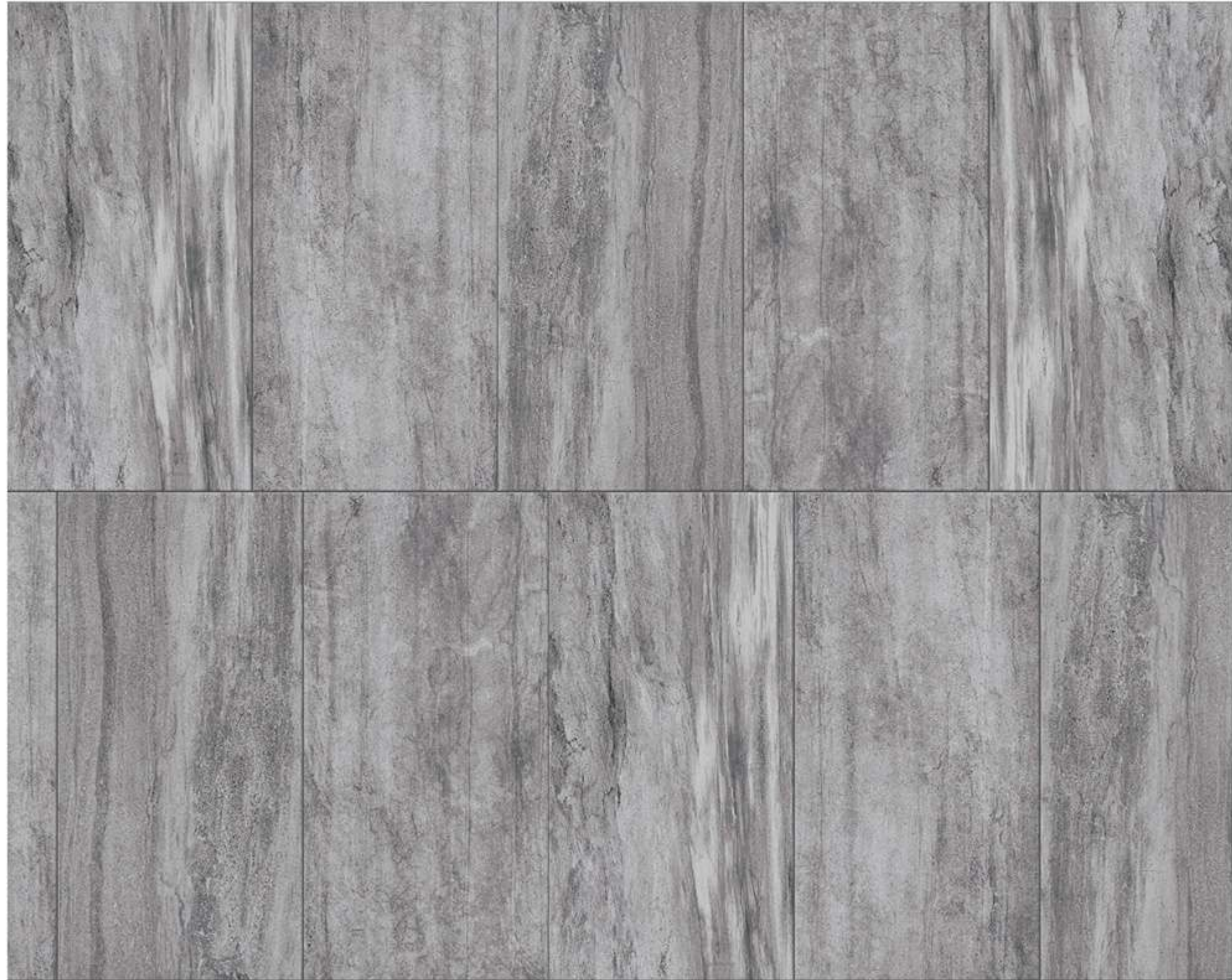
Remix METAL 60x120cm | GRM03