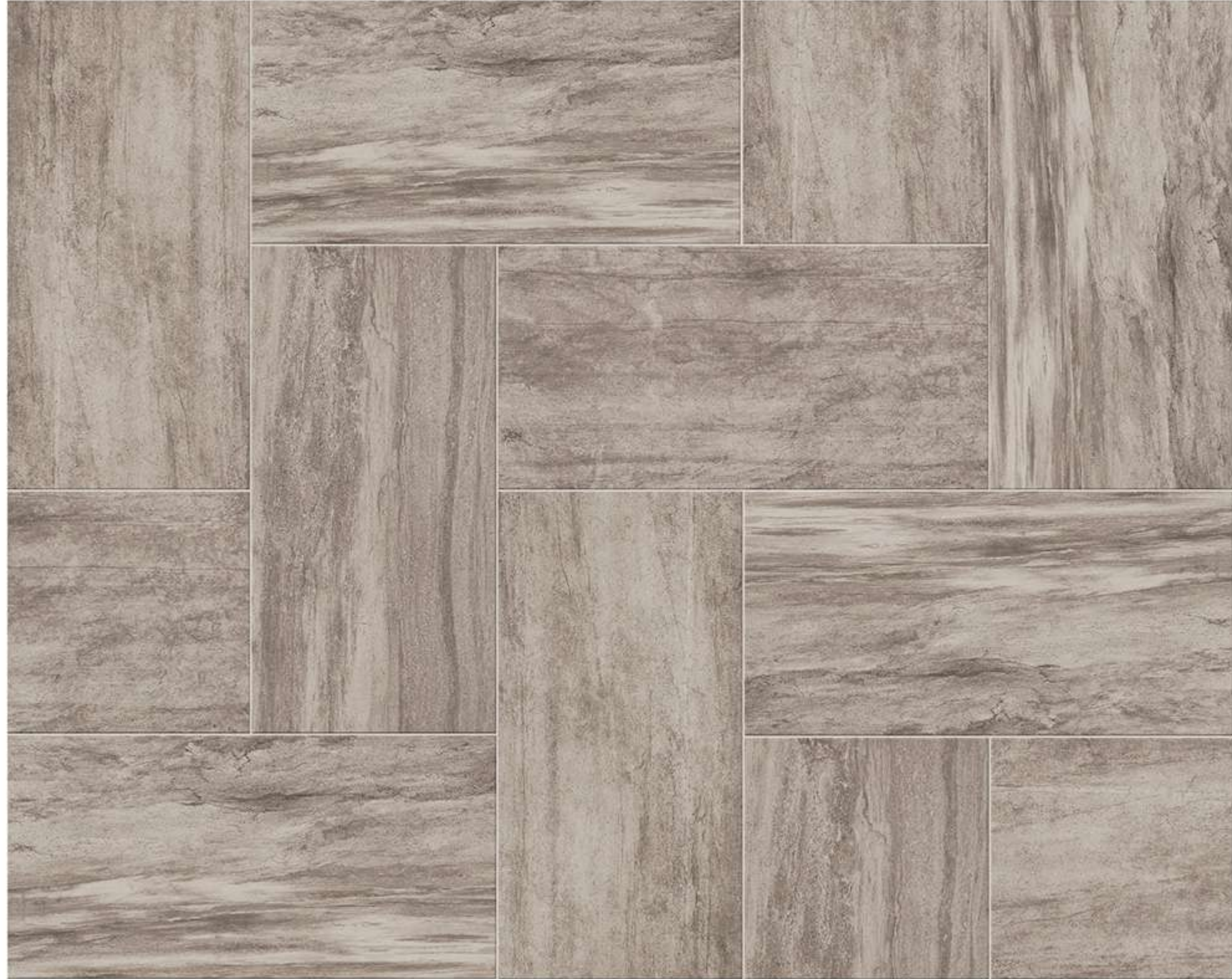
Remix JAZZ 60x120cm | GRM02