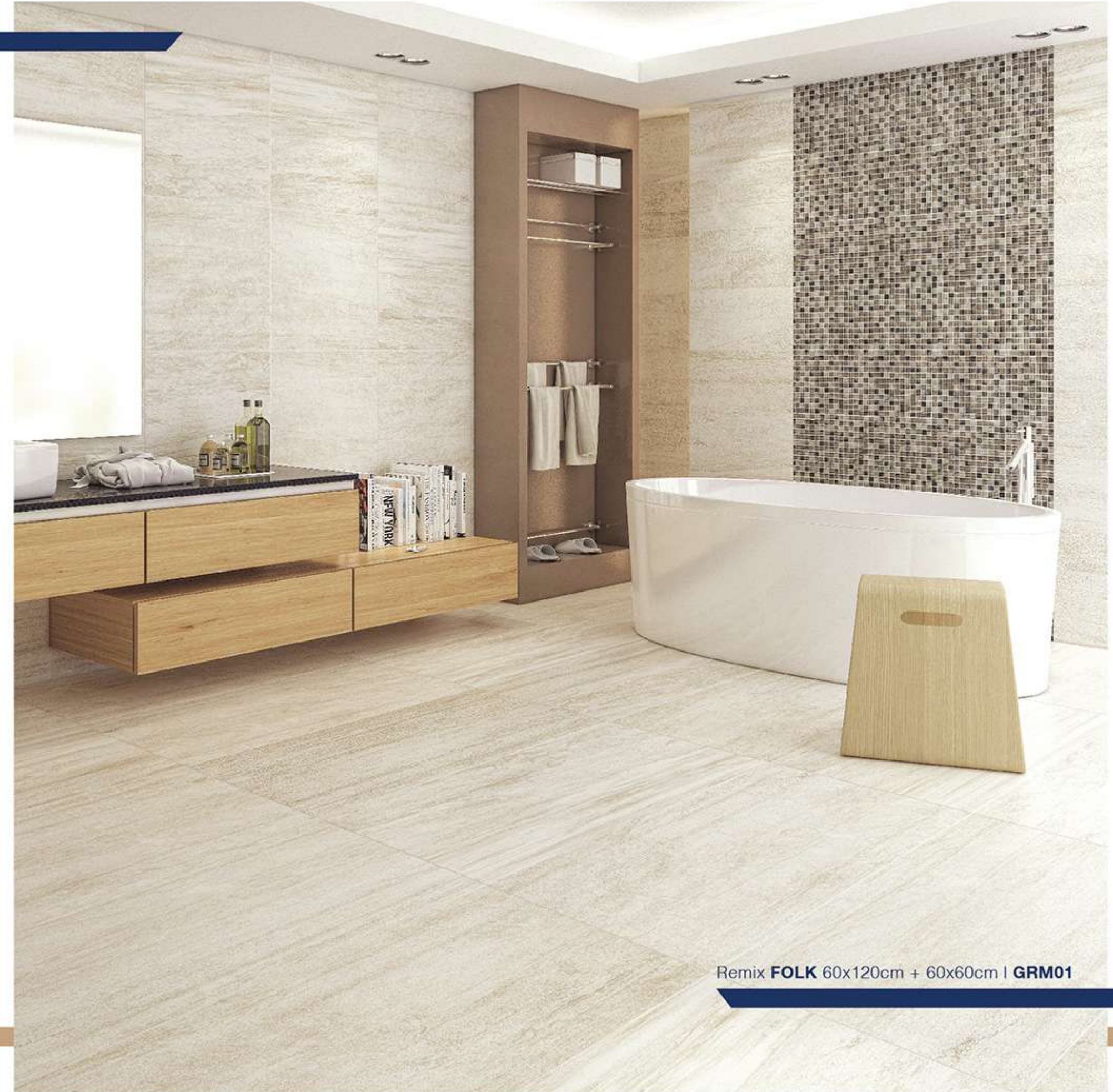
Remix FOLK 60x120cm + 60x60cm | GRM01