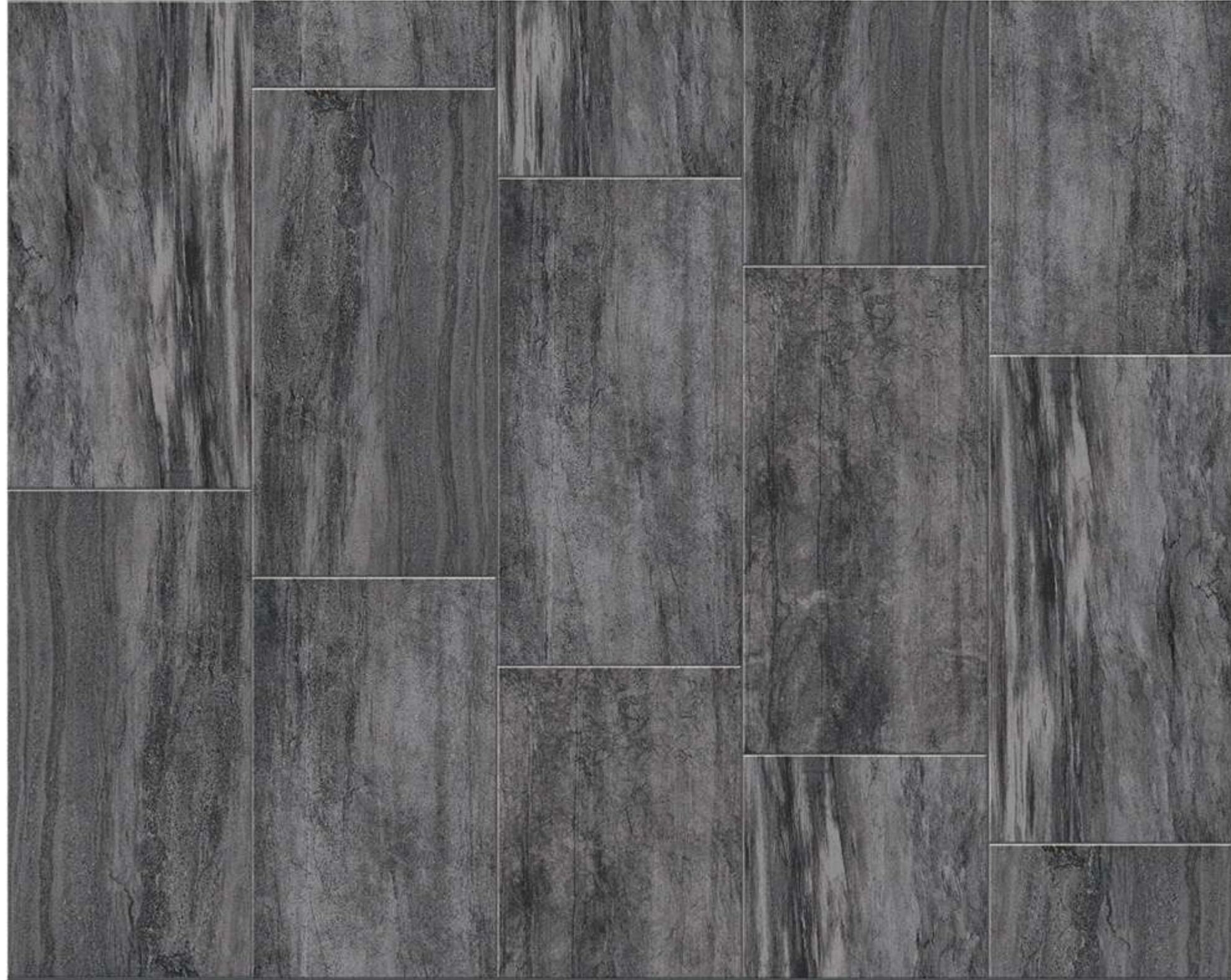
Remix POP ROCK 60x120cm | GRM04