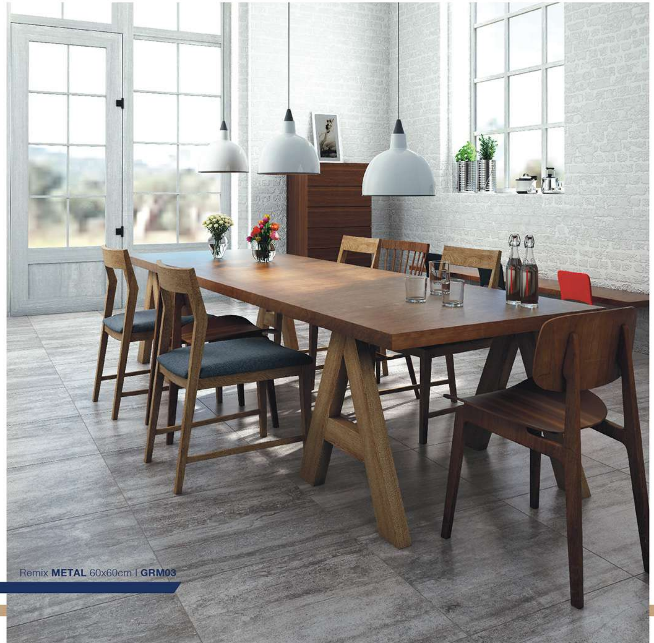
Remix METAL 60x60cm | GRM03