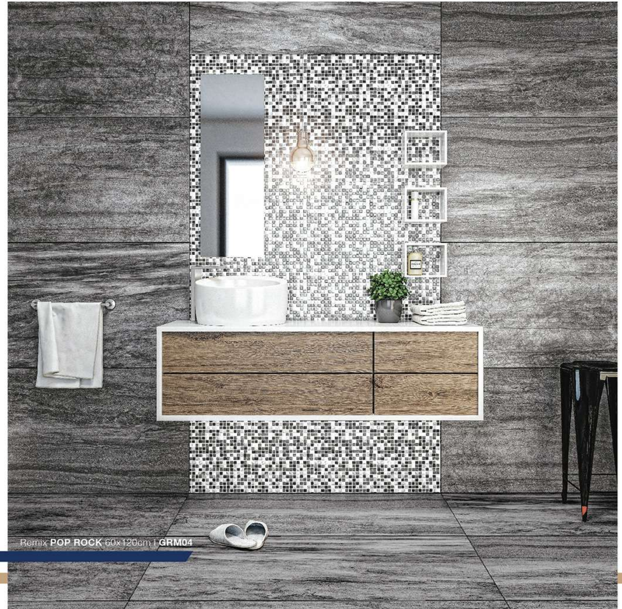
Remix POP ROCK 60x120cm | GRM04