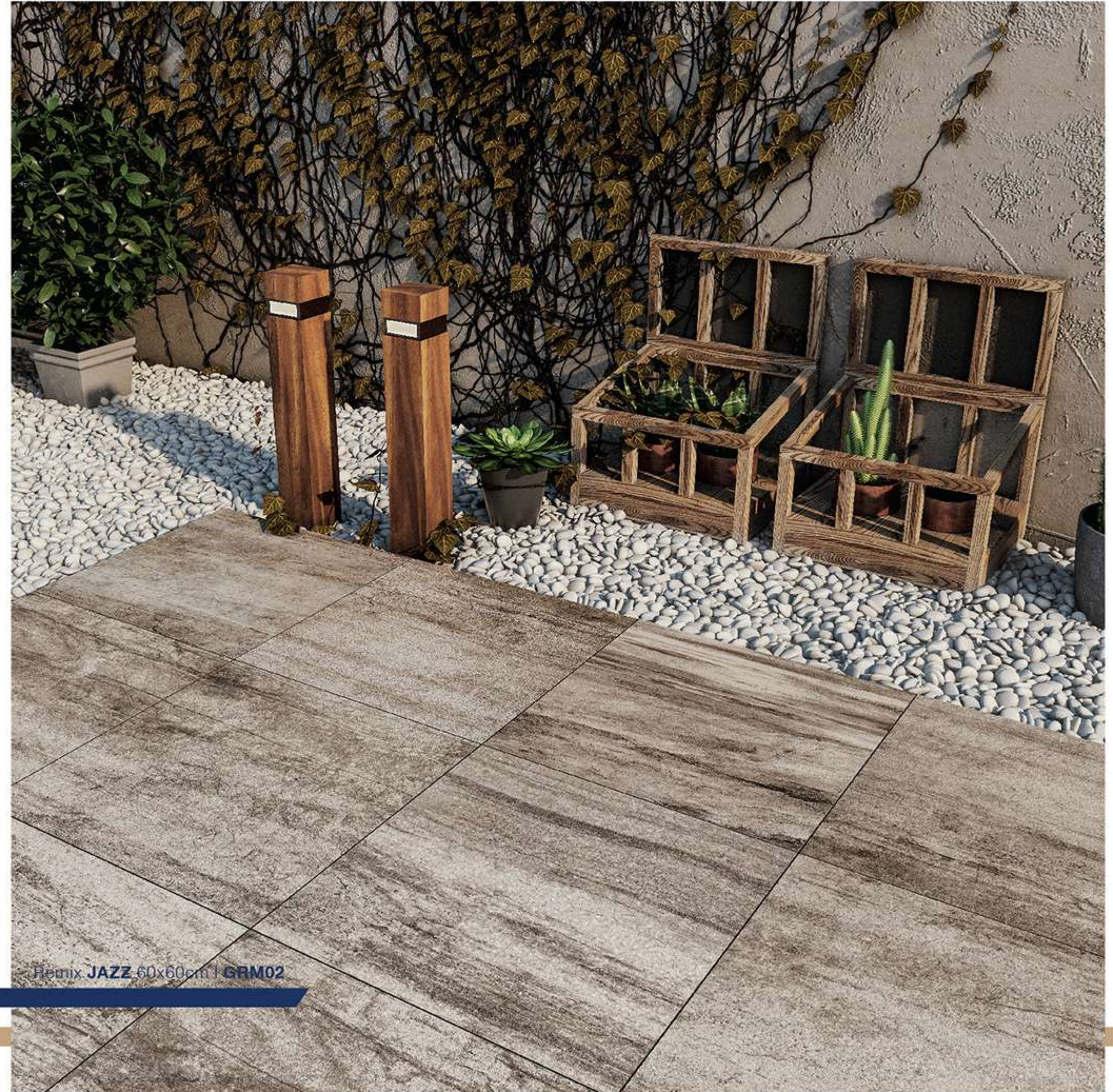
Remix JAZZ 60x60cm | GRM02