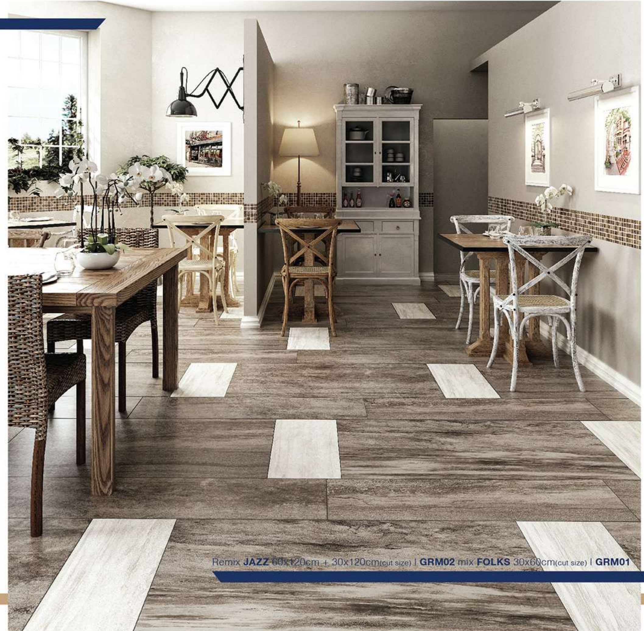
Remix JAZZ 60x120cm + 30x120cm(cut size) | GRM02 mix FOLKS 30x60cm(cut size) | GRM01