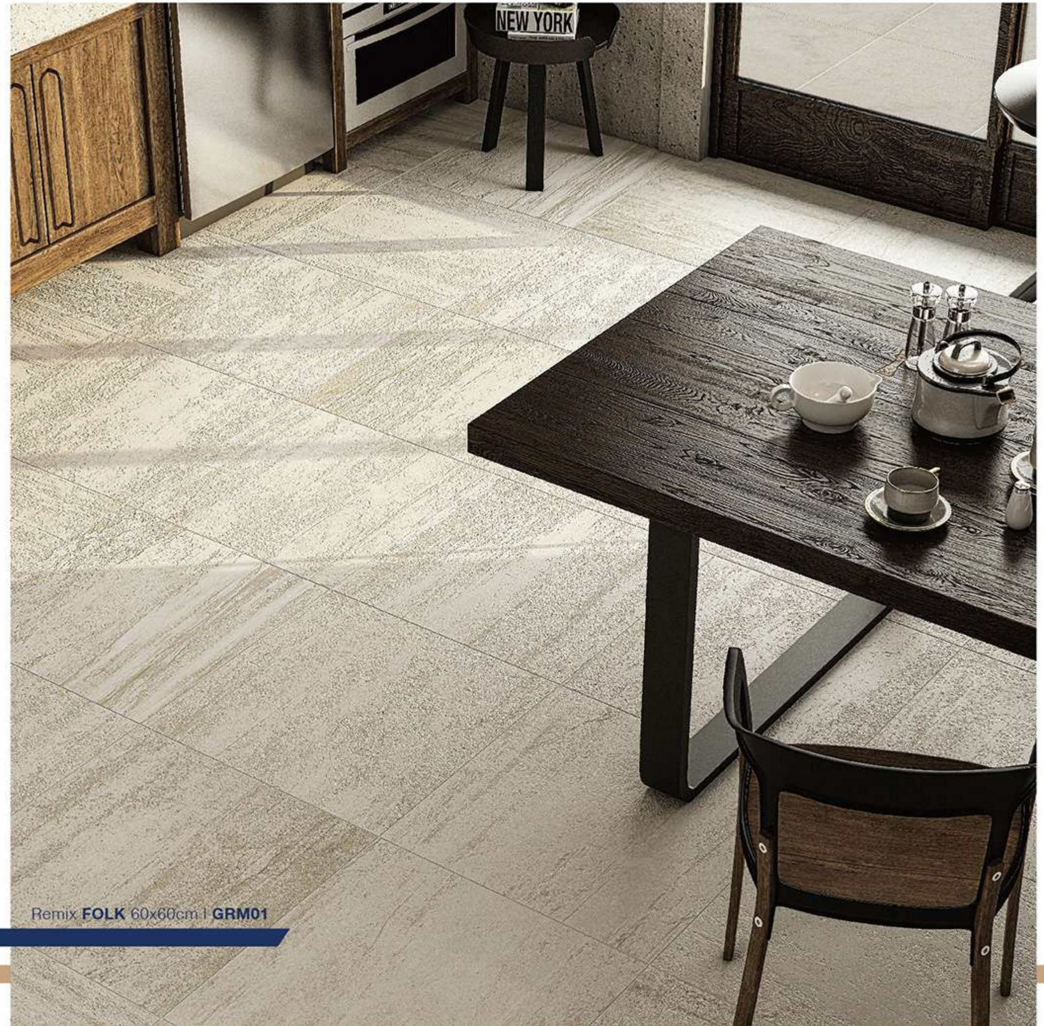
Remix FOLK 60x60cm | GRM01