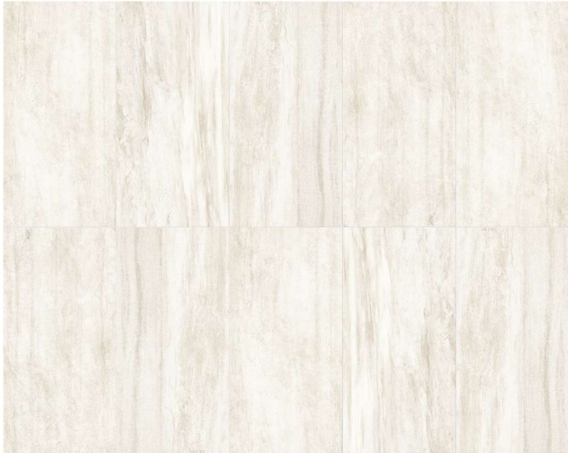
Remix FOLK 60x120cm | GRM01